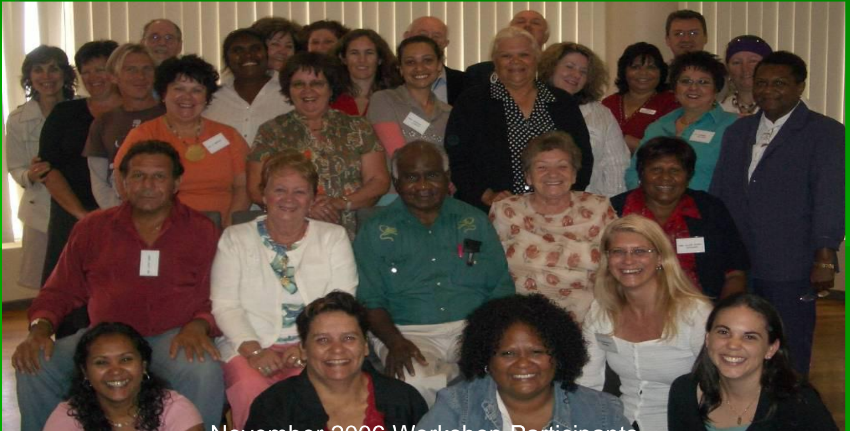
November 2006 Workshop Participants